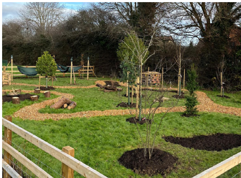
Westfield School, Buckinghamshire